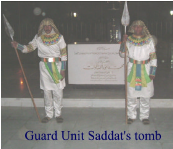
Guard Unit Saddat's tomb