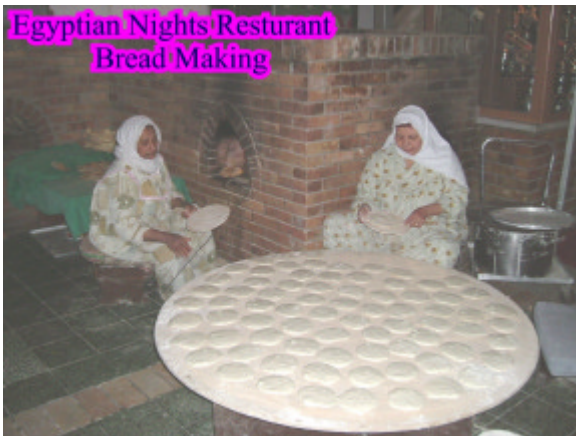
Women in long dresses and head scarves