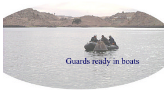
Guards ready in boats