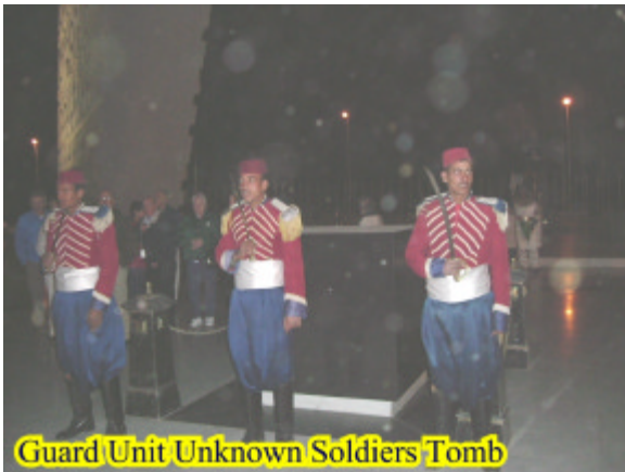
Guard Unit Unknown Soldiers Tomb