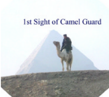
1st Sight of Camel Guard