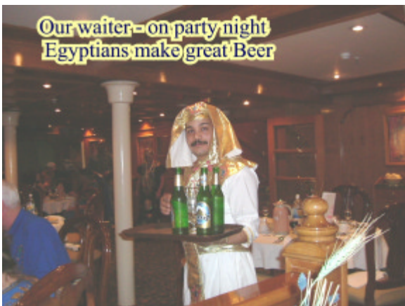
Our waiter - on party night Egyptians make great Beer