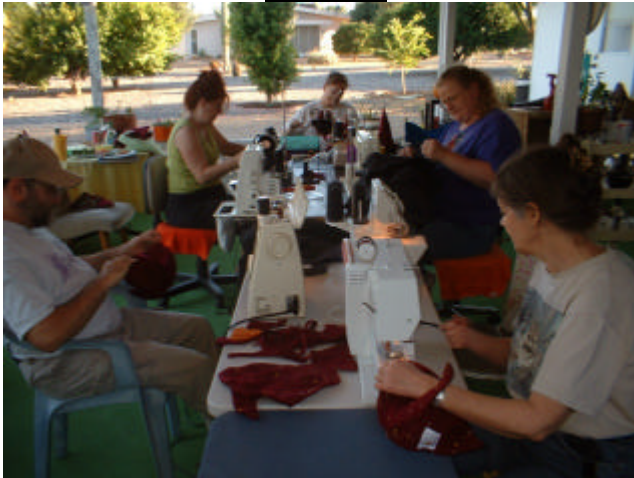
Building hats and capes at our November Sweatshop.