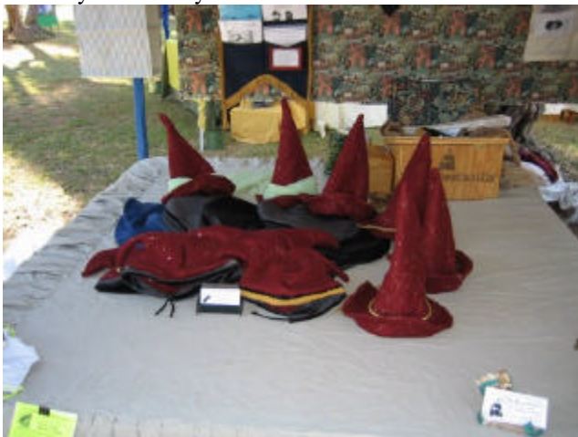
The Finished Hats, seen on Randall's table at the Devonshire Renaissance Faire.