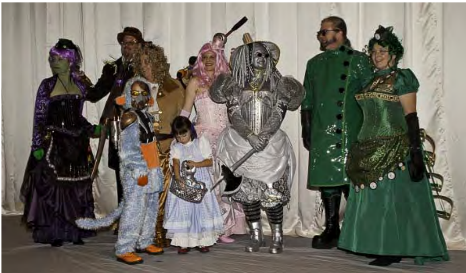
Wizard of Oz