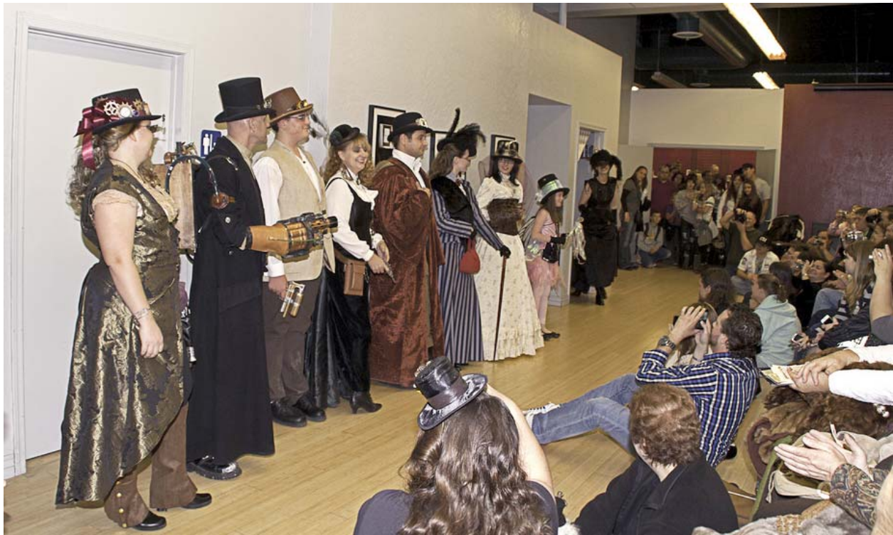
A Steampunk/Victorian fashion show what a capital idea!

I'd also like to express my condolences to the owners of Evermore Nevermore over the decision to close their shop, downtown Mesa will never be the same.