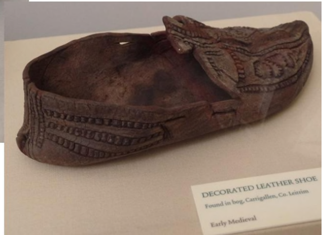
DECORATED LEATHER SHOE Found in bog, Carrigallen, Co. Leitrim Early Medieval