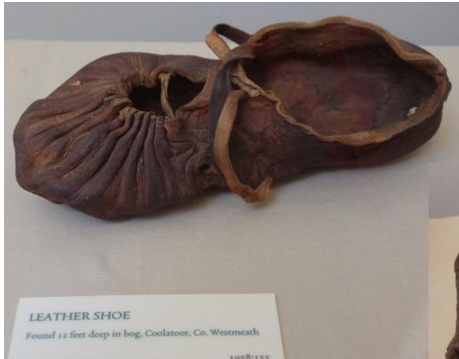
LEATHER SHOE Found 12 feet deep in bog, Coolatoor, Co. Westmeath

For the St. Patrick's Day parade, here are some medieval Irish shoes seen at the National Museum in Dublin.