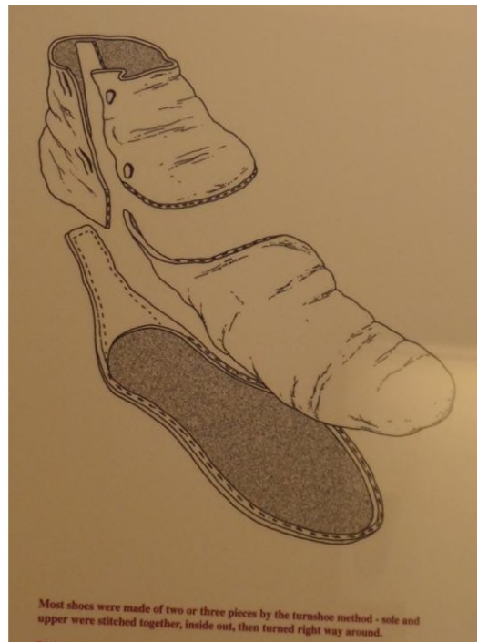
Most shoes were made of two or three pieces by the turnshoe method - sole and upper were stitched together, inside out, then turned right way around.