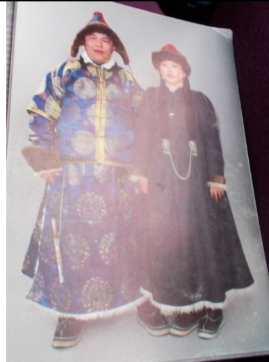
Our guide in Ulan Ude, in Siberia, just north of Mongolia, shared these.