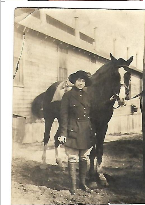
May 15 '26 - STAFFORD Cousins & MA